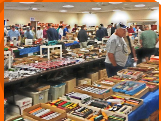
Searching for bargains.