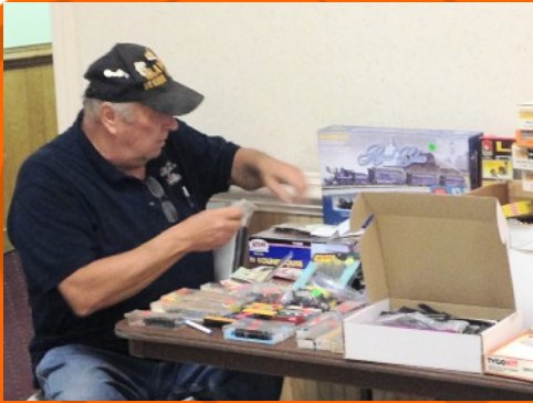
The club table