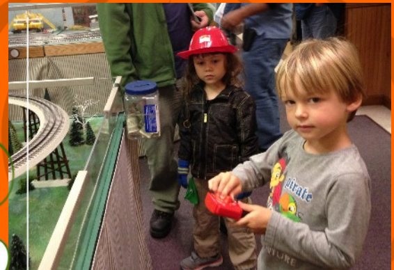
Enjoying Thomas the Train Layout