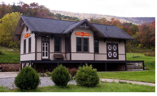
Figure 6 - Tuscarara, PA.