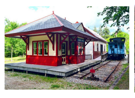
Figure 5 - Loon Cove, VA