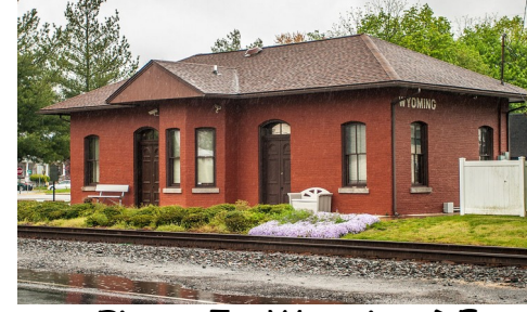
Figure 7 - Wyoming, DE