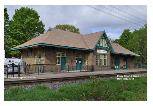
Figure 3- Parry Sound