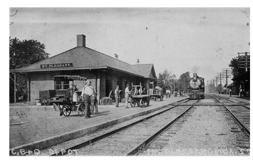
Figure 4 - Mt. Pleasant, MD