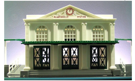
Plasticville Union Station

Plasticville also made a fancy station modeled after Union Stations in Chicago, Denver, etc.