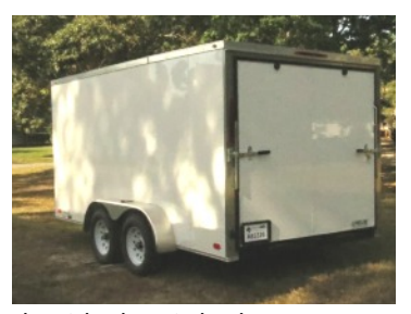
7 foot by 14 foot, V-Nose, 4 wheels with electric brakes, enclosed club trailer stored at the hobby shop.