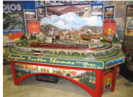
Commercial layout display by Dunham Studio in Orange Hall