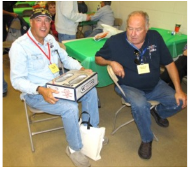
"Wow...Look what I found!" says