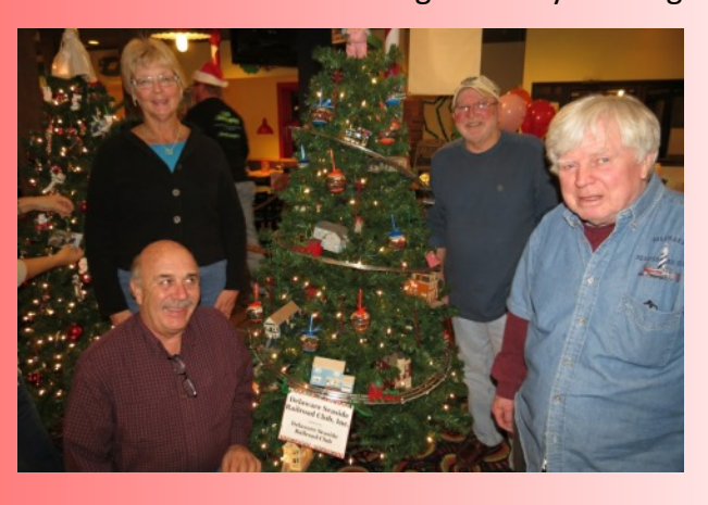
Christmas Tree Decoration Contest at Grotto Pizza Restaurant in Ocrean View.

The annual Christmas Train Tour sponsored by the SeaSide Hobbies store is finally organized for public dissemination. The first date is Saturday, December 7<sup>th</sup>. The paper copy with tables and maps is available at the hobby shop. A digital copy is available on the club web site, www.delawareseasideraillroadclub.com, with the schedule and maps.