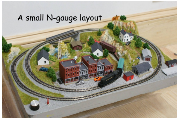
A small N-gauge layout