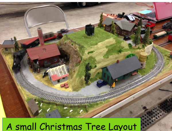
A small Christmas Tree Layout

For those of you who would like a larger layout, here is an excellent Christmas layout.