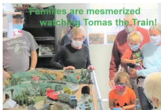
Families are mesmerized watching Tomas the Train!