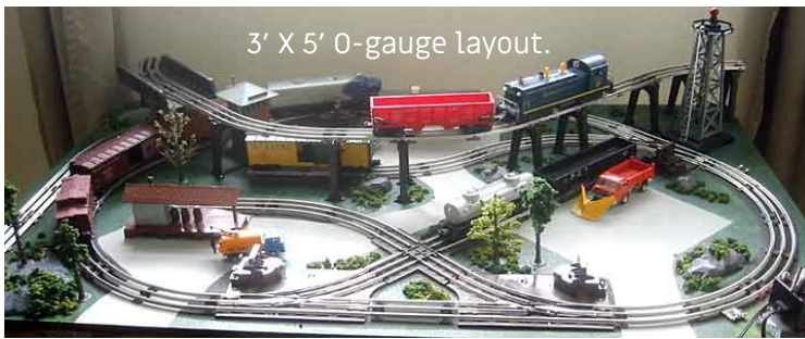
3' X 5' O-gauge layout.