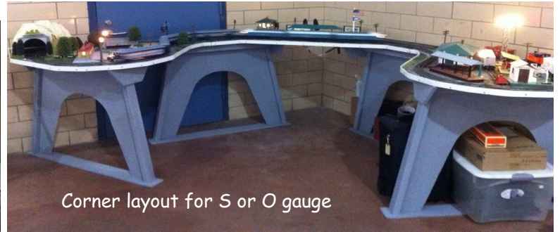
Corner layout for S or O gauge